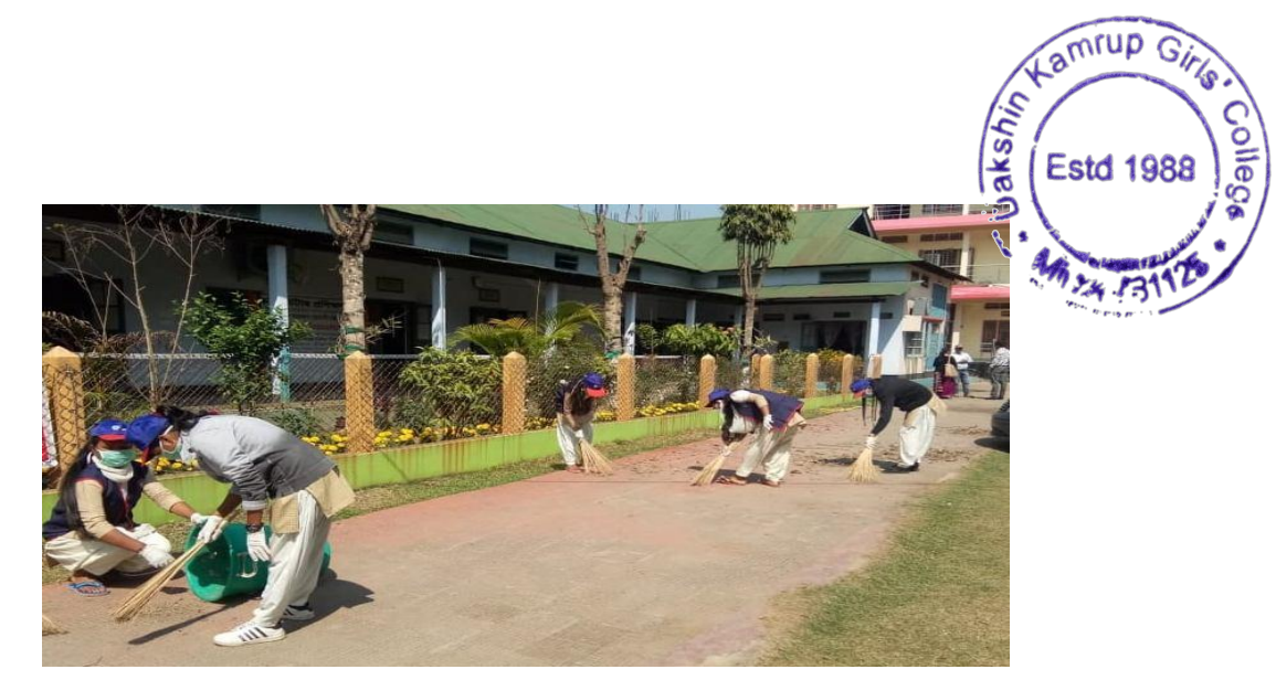
Swachhta Hi Seva a few no of programmes have been scheduled for the NSS