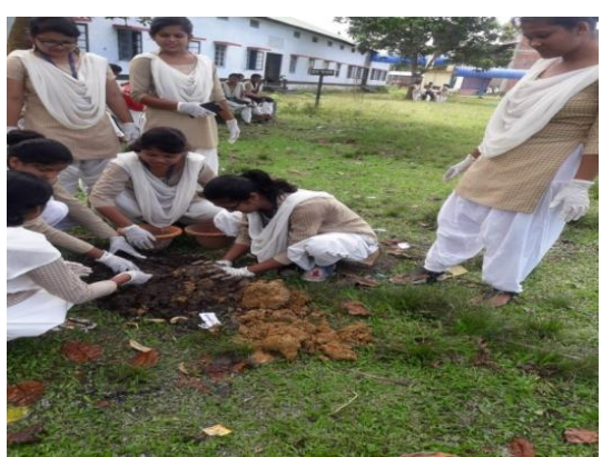
Plantation Drive in and around the campus