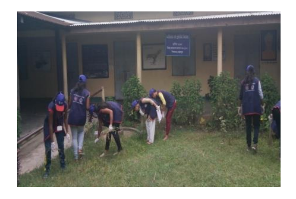
Cleaning Drive in the campus inadopted village